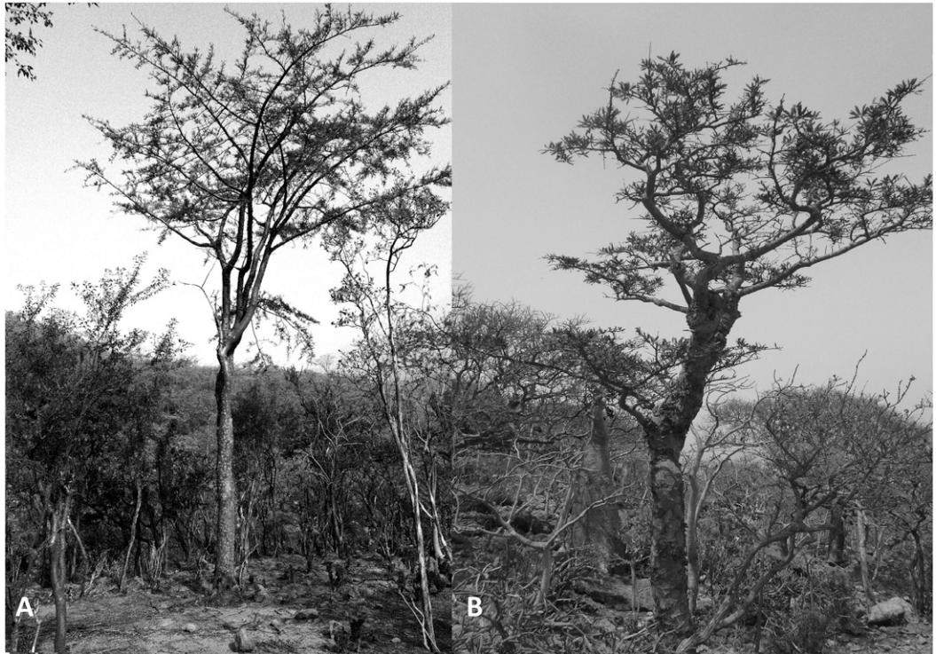
Figure 2. Overall habit of Boswellia socotrana Balf. f. subsp. socotrana . —A. Unpruned tree with straight branches and thin crown. —B. Pruned tree with crooked and thickened branches.

Yemen. Socotra: s. loc., Balfour, Cockburn & Scott 710 (lectotype, designated here, K-000199635!; isolectotype, E-00436149!).